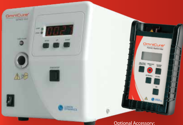
Optional Accessory: OmniCure® R2000 Radiometer

To accommodate various customer needs, the OmniCure® S1500 can be used with four different light delivery options. Ideally used with a multi-legged High Power Fiber Light Guide to cure multiple sites with a single light source, Single-Legged, Liquid-Filled and Fiber Light Guides are also available.